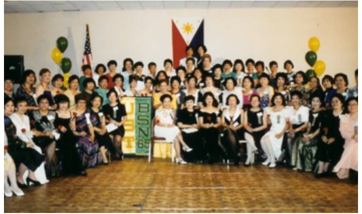
UST College of Nursing Class 1965 celebrated their 30th Reunion Anniversary at the Sheraton Meadowlands in Rutherford, New Jersey