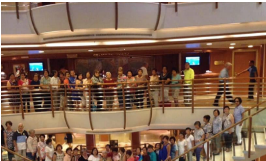
50th Anniversary Reunion during the 5-days Caribbean Cruise on April, 2015