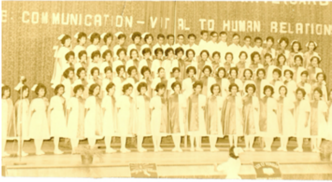
UST College of Nursing Class 1965 participated at the National Songfest Festival at the Araneta Coliseum, Philippines and won the first prize trophy.