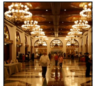
The splendor that is Manila Hotel!