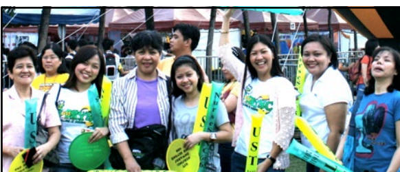
At UST fairgrounds -- nursing faculty caught playing hokey on a school-day!